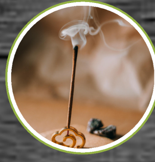
Incense Stick Fra.